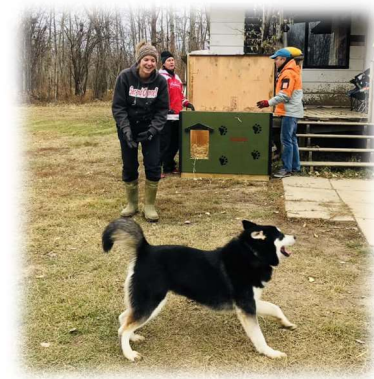
Pet Shelter Delivery

In addition to spaying or neutering every pet that comes into our care for rehoming, SCARS also provides spay-neuter-return (SNR) for owned pets in our target communities. Our volunteers pick up pets at their homes and transport them to a veterinary clinic for a health check, spay or neuter, vaccination and a microchip. The pets spend some time at the clinic recovering and then we drive them home again.