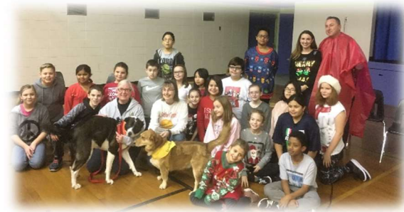
St. Vladimir School in Edmonton