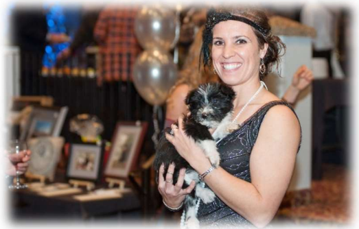
Canines & Cocktails 2018