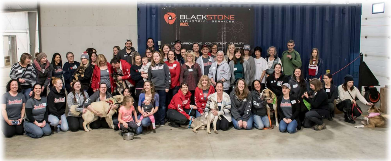
SCARS volunteers at an adoption event