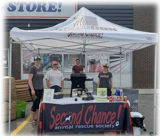
SCARS info booth at Windsor Plywood

Those who donate their time to help pets in need are our most important asset. We held new volunteer orientations every four to six weeks during 2018. As part of our daily operations, SCARS volunteers fostered pets, organized fundraisers, promoted SCARS at third-party events, transported pets, walked dogs, picked up donations, processed adoptions, responded to public inquiries, and more. They logged over 142,000 hours during 2018. Here are some examples of our activities that are led by volunteer coordinators.