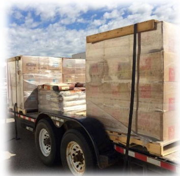
Champion Petfoods Donation

We rely on donations of pet supplies that are used by our volunteers to care for adoptable as well as sanctuary program dogs and cats. Champion Petfoods and Kane Veterinary Supply together provide us with all of the Orijen and ACANA pet food for our foster dogs. We estimate these two donors provided 25,000 pounds / 11,370 kg of dry food in 2018. The retail value is about $90,000. We also receive food donations from pet