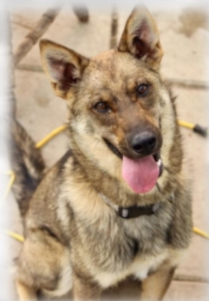
Zeus is a 2-yr-old male, shepherd mix