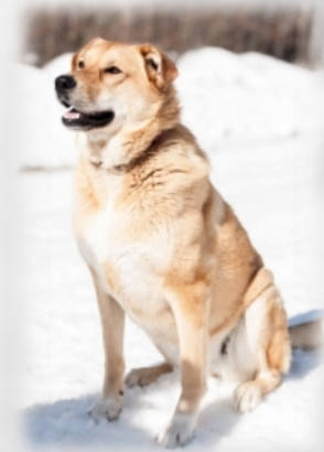
Molly is a 3-yr-old Female mixed breed