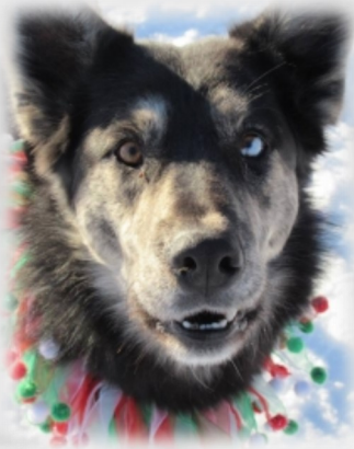
Target is an adult male, mixed breed

Here are a few of our adoptable pets. To see more, visit www.scarscare.ca . There are typically 200 companion animals of all ages, types and sizes in our care. We are always looking for adopters and more foster homes. If you have room in your home and in your heart for a new friend, contact SCARS.