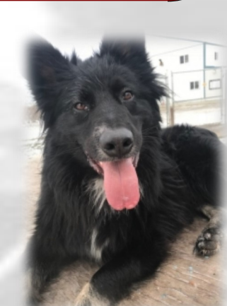
Leonard is a 3-yr-old male, collie mix