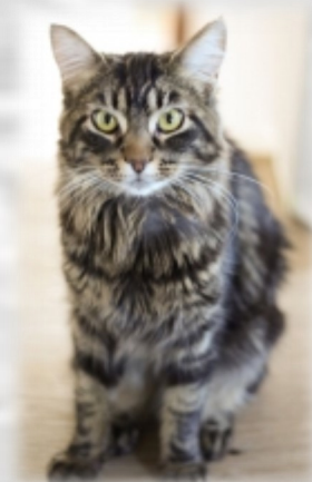
Dorothy is a 3-yr-old female mixed breed

Please consider fostering for SCARS. As a foster home, you will provide temporary care for an animal until we can find it a suitable permanent home. Becoming a foster home is easy and there is absolutely no cost or long-term obligation. Foster homes are vital to our success. Simply put, they save lives. Sadly, every day in Alberta there are hundreds of pets waiting to be rescued. Our goal is to make the fostering experience as enjoyable as possible for you and your family.