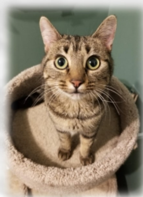
Lil Peep is a 9-mo-old female mixed breed