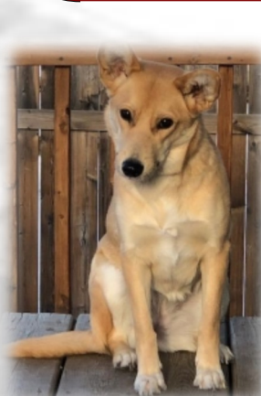
Bella Bee is 3-yr-old female, mixed breed