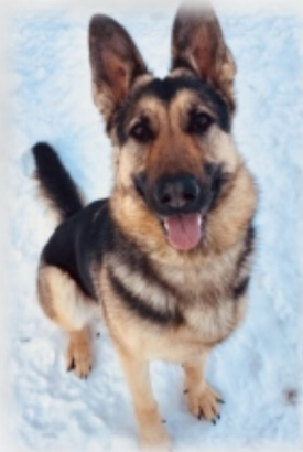
Marlee is 1.5-yr-old female Shepherd mix