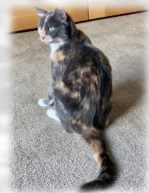
Holly a female adult calico