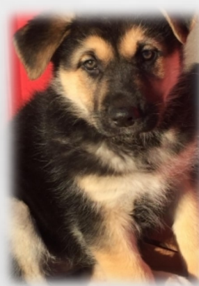
Adley is one of the many available puppies